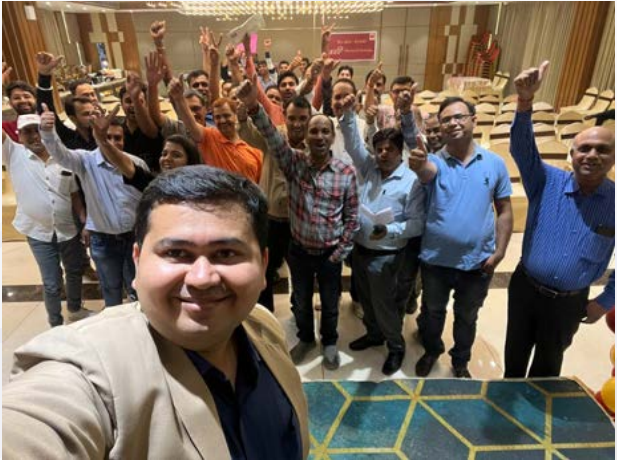
Motivating performers of Ultratech cement.