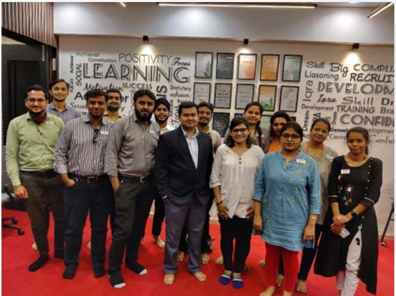
A training on leadership skills