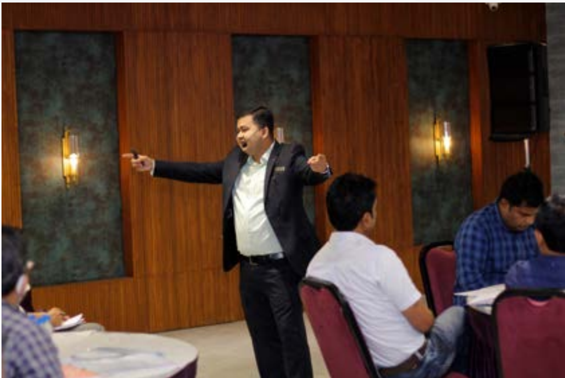
A training on improving sales strategies.