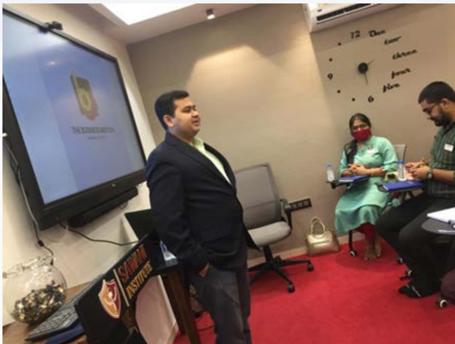
A training on team management