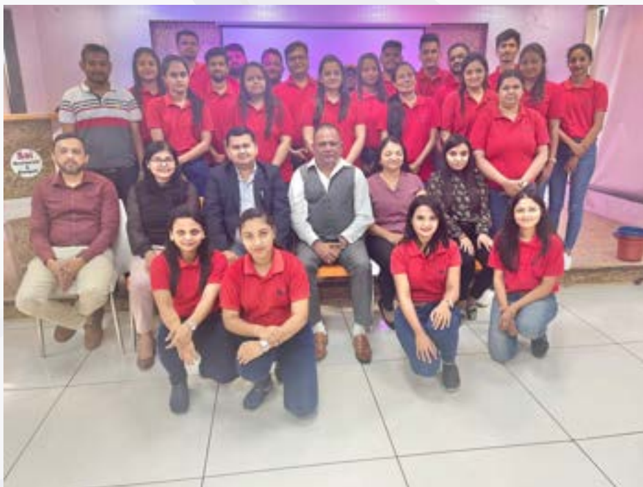
Imparting service mindset in client's team members.