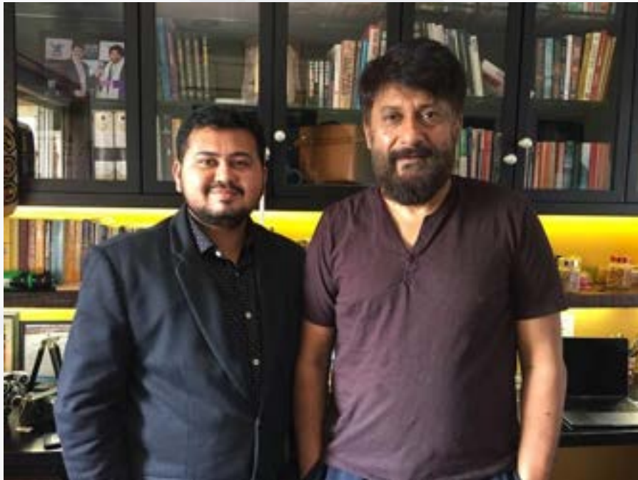
Associating with famous filmmaker and social activist Mr. Vivek Agnihotri.