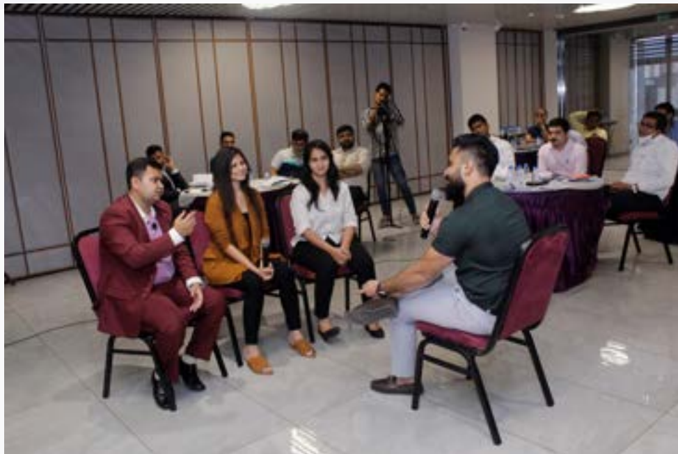
Role play during the sales improvement training.