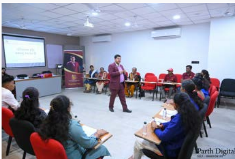
Motivating underprivileged women of small scale industry.